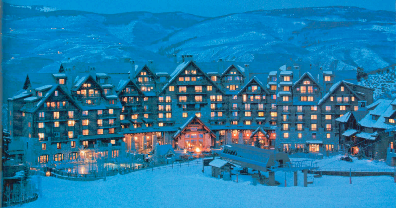
The Ritz-Carlton Bachelor Gulch

400-thread count Frette linens, marble bathtubs, high speed wireless Internet, ski concierge, ski nanny, Bachelor Gulch youth spa program, dog-friendly accommodations and the unique Rent-a-Lab program with the resort's resident yellow Labrador retriever for guests who chose not to bring along their four-legged friends.