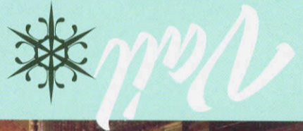
The Arrabelle at Vail Square

FOR MORE INFORMATION vail.snow.com vailgov.com