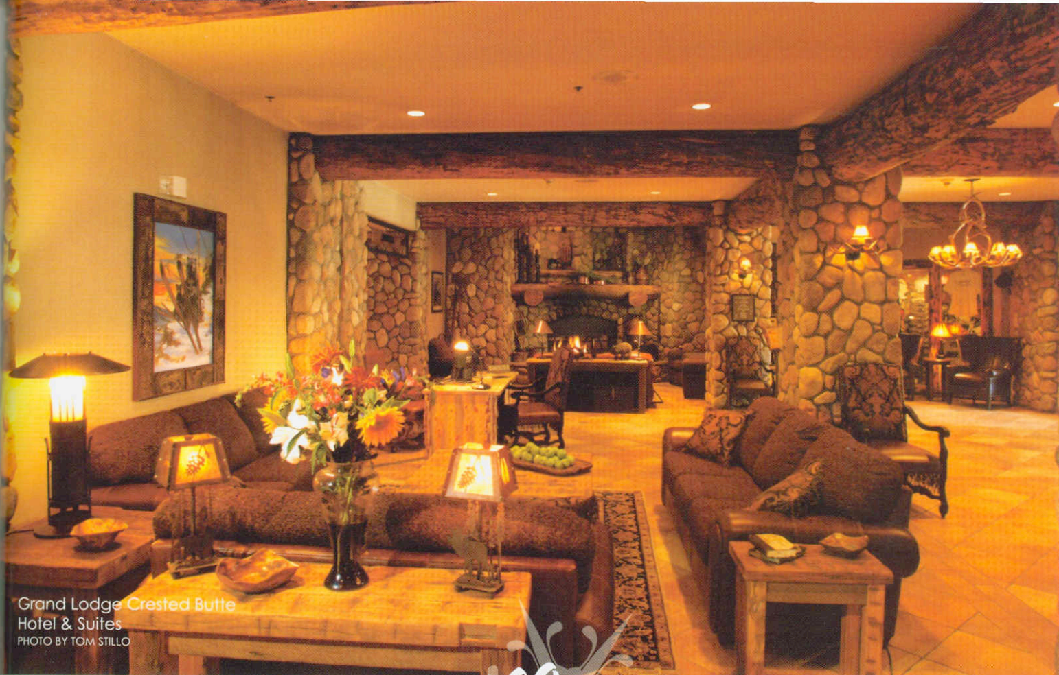
Grand Lodge Crested Butte Hotel & Suites